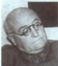
General Jose Menant Miaja