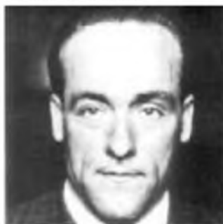
Juan García Oliver (CNT) Minister of Justice