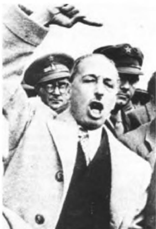
Lluís Companys i Jover, Generalitat President (CNT is excluded from the Generalitat in July 1937)