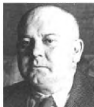
Juan Peiró Belis (CNT) Minister of Education