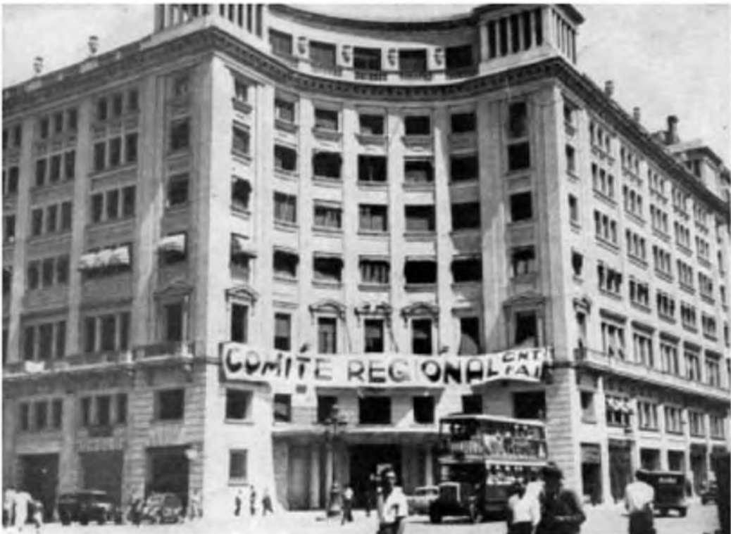
Barcelona offices of the Catalan Regional Committee of the CNT-FAI (casa CNT-FAI), originally the Banco de Cambio, in the Via Layetana. The translation, press and radio service also operated from here.

We would do well to bear the provisions of this agreement in mind for when we come to tackle the chapter on the political counter-revolution mounted in Aragón a few months later, something which was to demonstrate the emptiness of written undertakings when these are not inspired by an elementary sense of decency, honour and sincerity.