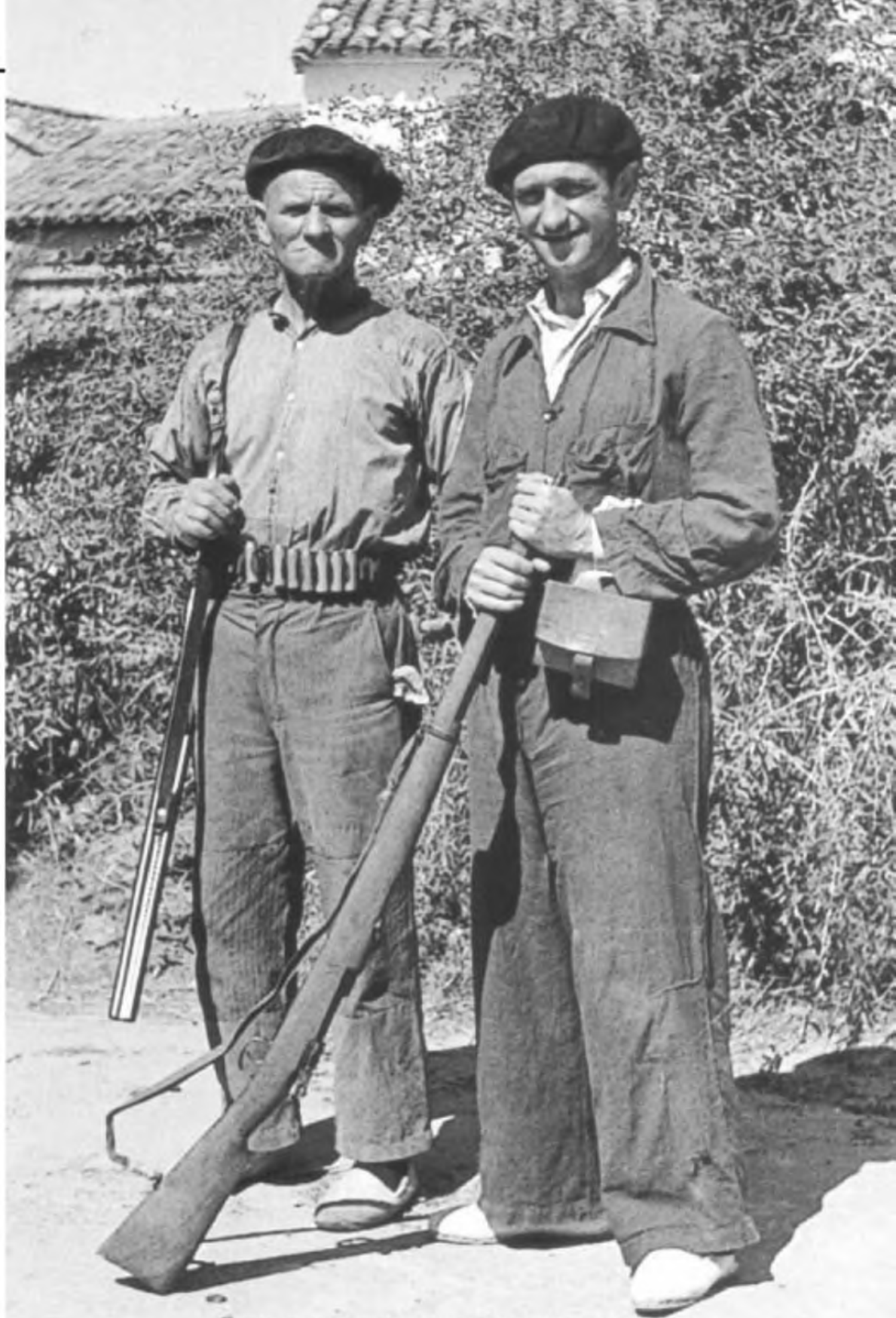
Argüés (Huesca), August 1936. Two generations of milicianos