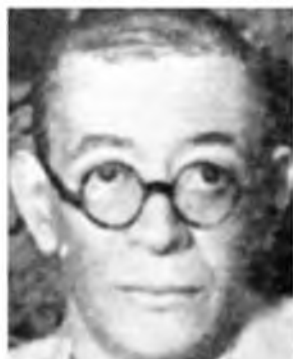
Julián Zugazagoitia (PSOE) Minister of Interior