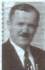
Colonel Alexander Orlov: head of the Soviet security service (NKVD, successor to the OGPU/GPU) in Spain and effective head of the Republican secret police, the SIM.