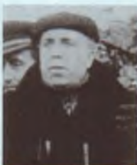
Indalecio Prieto y Tuero