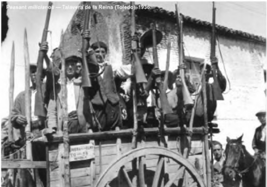
Peasant militianos — Talavera de la Reina (Toledo), 1936.