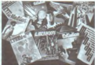
Newspapers and periodicals of the CNT, FAI, FIJL and Mujeres Libres.