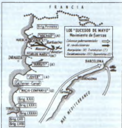
Disposition of governmental and militia columns at the Aragon Front during the 'May Days' of 1937.