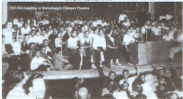
CNT-FAI meeting in Barcelona's Olympia Theatre