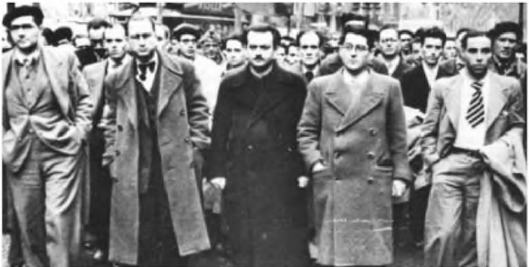
POUM leaders Julián Gorkin (editor of La Batalla , second from left) and Andreu Nin (political secretary of the POUM, second from right). The POUM was declared illegal on 16 June and forty of its leaders arrested. Nin was murdered on 21 June on the orders of Alexander Orlov, Stalin's NKVD chief in Spain and head of the SIM.