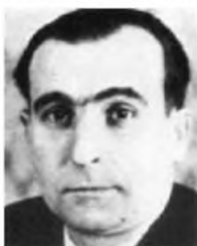
Juan López Sánchez (CNT) Minister of Commerce