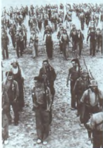
Milicianos militarised in the 118 Brigada de Andorra (Aragón)