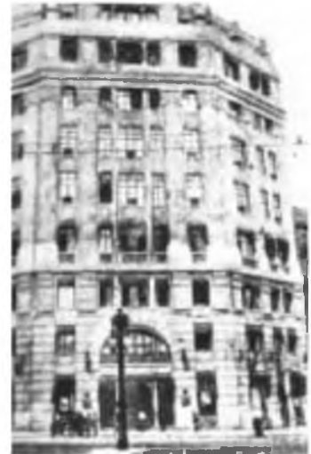
La Telefónica (Plaza de Catalunya)