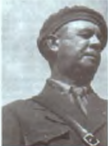
André Marty, supreme commissar of the International Brigades and executive committee member of the Communist International. In his autobiography he claims to have ordered the executions of 'only' 500 men.