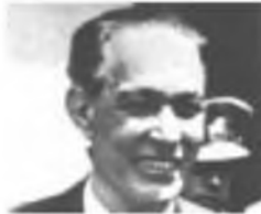
Generalitat Internal Security Minister Artemi Aiguader