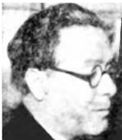
Rafael Vidiella (PSUC) Finance Minister (Generalitat, July 1937)