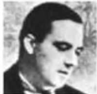
Prime Minister/ Defence Minister Josep Tarradellas