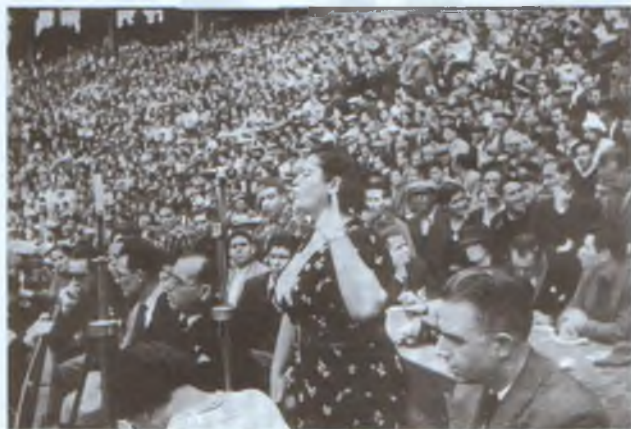
Federica Montseny addresses 50,000 people in Barcelona's Plaza de Toros.

The pro-communist elements had won the day.