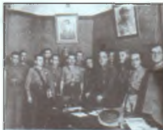
Left: General Pozas and his officers occupy the offices of the Council of Aragon, having arrested the councillors and council officials.