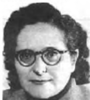
Federica Montseny Mañé (CNT) Minister of Health