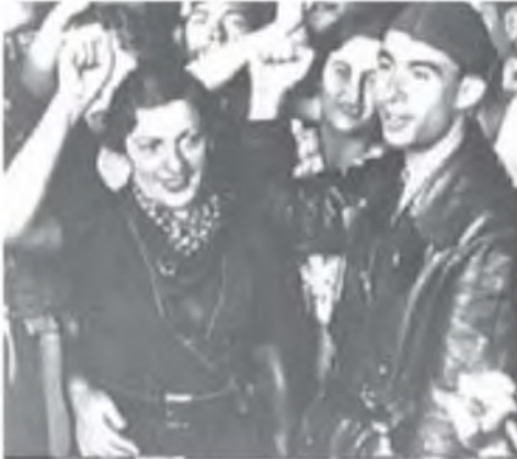
A libertarian wedding