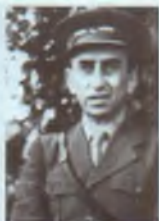
Luigi Longo (right): Italian Communist Party and Comintern member, and co-founder with André Marty of the International Brigades