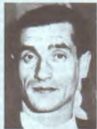
Joaquin Ascaso y Budría, anarchist chairman of the Consejo Regional de Defensa de Aragón.