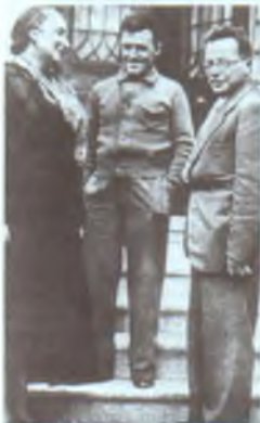
Dolores Ibárruri (La Pasionaria) with Italian Comintern member Palmiro Togliatti (right).