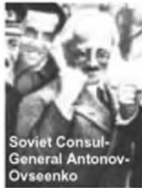
Soviet Consul- General Antonov- Ovseenko