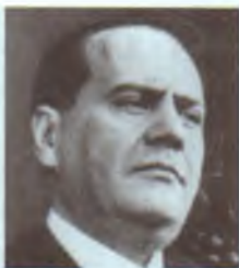
Right: Dr Juan Negrin