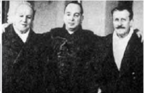
Melchor Rodríguez 'The Red Angel', centre, anarchist, Director General of Prisons in the Republican Zone from November 1936 to March 1937. During the time he held the post of Delegado Especial de Prisiones, he prevented the removal of any prisoners, Republicans or Nationalists from jails under his control. He prevented the murder of many prisoners, including Muñoz Grandes and Serrano Suñer. In the photo above he is embracing the brothers Alvarez-Quintero, held prisoners by the Republic.