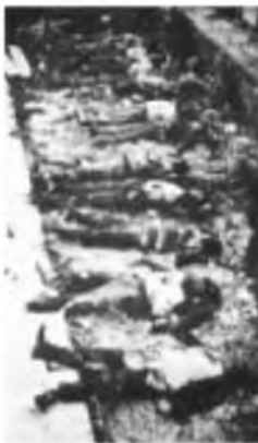
Corpses of young libertarians murdered in Sants cemetery, just a few of the 500 dead and 1500 wounded in the Stalinist-led repression of May 1937.