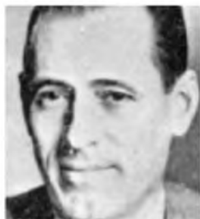
Vicente Uribe (PCE) Minister of Agriculture