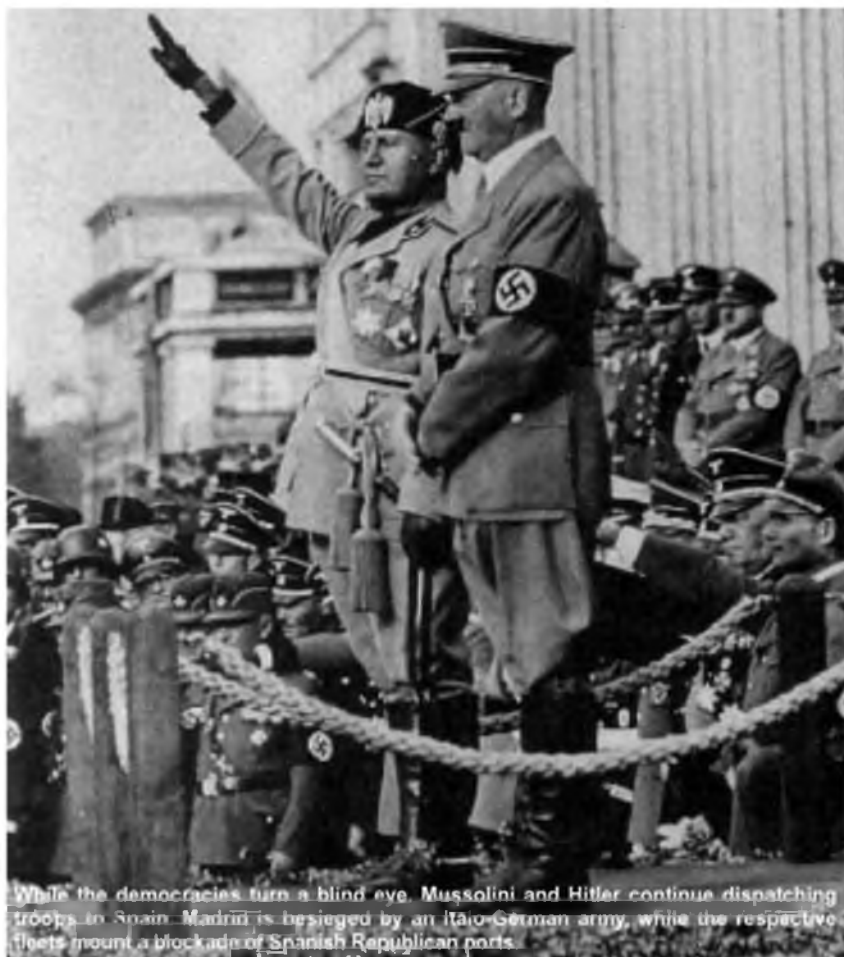
While the democracies turn a blind eye, Mussolini and Hitler continue dispatching troops to Spain. Madrid is besieged by an Italo-German army, while the respective fleets mount a blockade of Spanish Republican ports.

"We Spaniards are greatly thankful for your charity and the lint and ointments which you send us to repair Don Quijote's wounds; but we should be much more thankful if you were to outfit him with a new lance and an up-to-date shield."