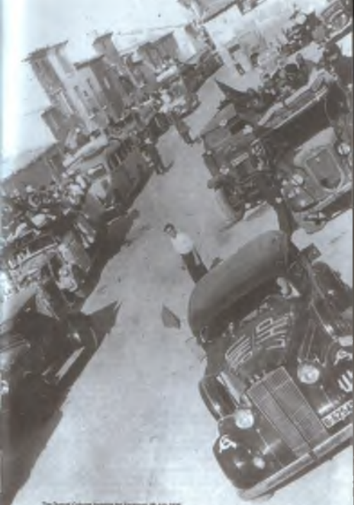
The Dupont Circle housing for Europeans, 18 July 1938